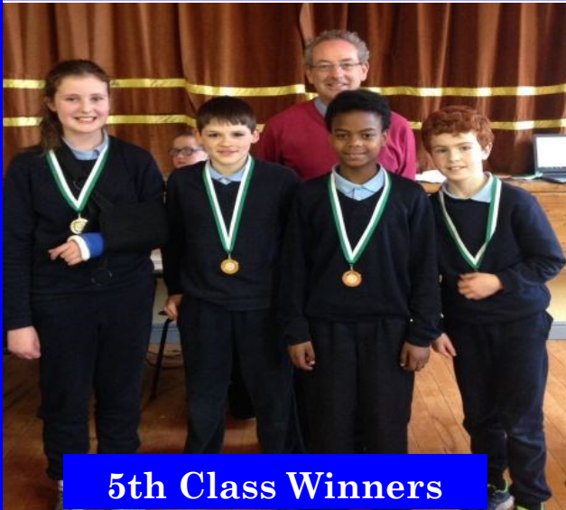
5th Class Winners

In groups of 3 or 4, they were put through their paces with 88 questions asked. Great fun was had and in the end, we had outright winners in all classes. Well done to all who participated!!