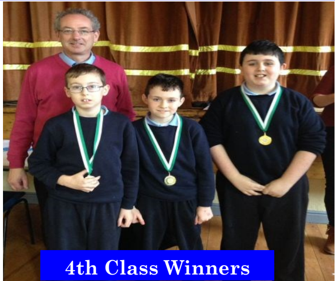
4th Class Winners