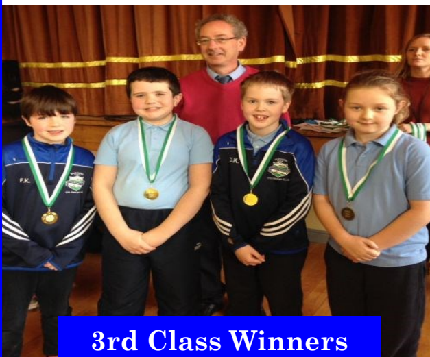
3rd Class Winners